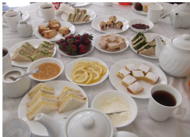
English Tea, April 29, 2015