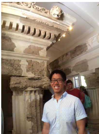
Visiting the museum at the Temple of Hephaestus, Athens

As I’m ending this report, I can’t help but remember the sights and sounds of the ancient city: from the soft rumble of the street merchants outside that awoke me each morning for class, to the aromatic lamb in my souvlaki nestled against fresh veggies, creamy tzatziki sauce and warm pita, to pearly-lit skies tucked away behind the glimmering Parthenon. I couldn’t be any happier for it—for having the ability to gather so many fond memories in a short summer