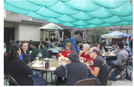
Friends sponsor Friday Café featuring the food and culture of Kazakhstan