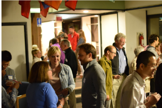
Friends Dinner Social, Nov. 7, 2015

NON-PROFIT ORG. U.S. POSTAGE PAID SAN DIEGO, CA PERMIT #1909